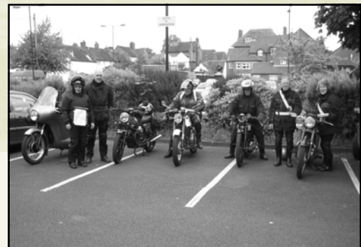
Contenders at the Start of the Welsh Weekend