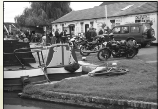
At Norbury Junction Coffee Stop