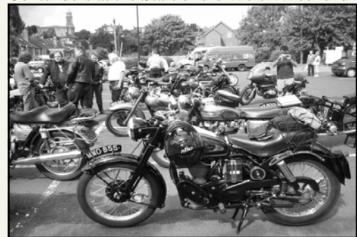
A Superb Collection of Machines ready for the Long Mynd Run