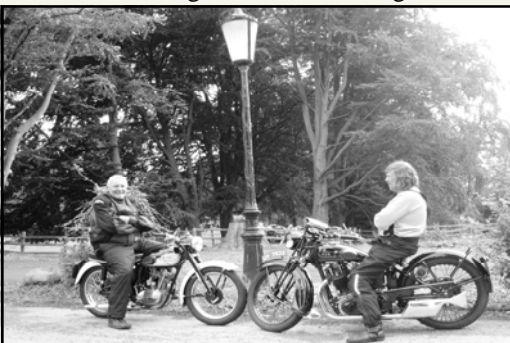
The Winners of the Picnic Concours