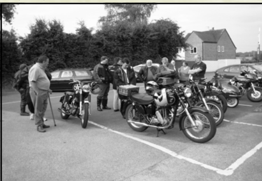
The Gathering at Ride a Bike Night