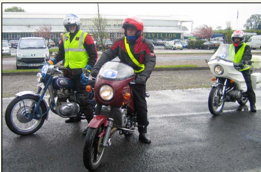
Left—Three riders from Burton on a Silk, Tri-Greeves and a Honda 400 four

Some members managed to pass through collecting their 6th checkpoint sticker.